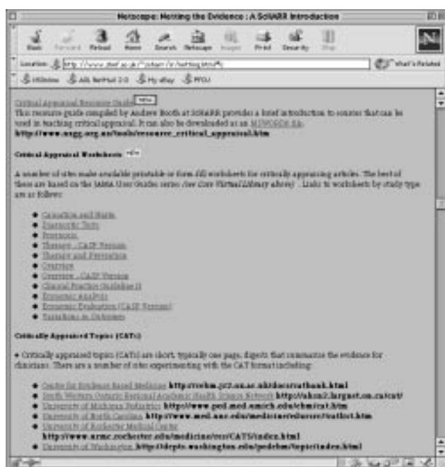
Netting the Evidence: A SchARR Introduction to Evidence-Based Practice on the Internet. Netting the Evidence is available at http://www.shef.ac.uk/~scharr/ir/netting.html .

Real time evidence-based practice is much more efficient when information can be found and retrieved online. The profusion of web sites and other electronic information sources, however, is so great that it is easy to get lost if you stray beyond such standard databases as Medline and the Cochrane Library or such favorites as the web site of the Centre for Evidence-Based Medicine ( http://cebm.jr2.ox.ac.uk/ ).