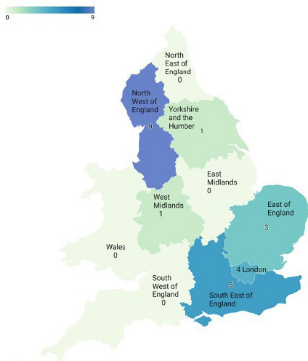
Figure 2 Map of the number of Prevention of Future Deaths reports involving COVID-19 issued by coroners in England and Wales between 1 January 2020 and 28 June 2021. Created by the authors.

prescribed, a measuring jug and instructions on how to use it, his death might have been prevented.